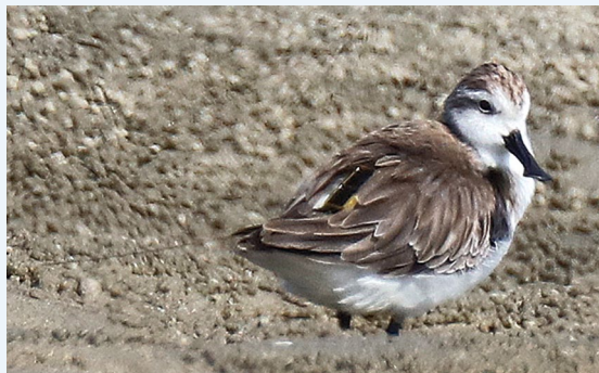
Spoon-billed sandpiper HU near Xitou, China.

Our 2g Solar PTT is currently being used to track several species in hopes of providing information with major conservation implications. The most recent species tracked with a 2g PTT is the spoon-billed sandpiper ( Calidris pygmaea ), one of the rarest bird species in the world, with an estimated 250 breeding pairs in 2014. Its precipitous population decline is linked to habitat loss (particularly at Yellow Sea stopover sites) and trapping. Clearly, this is a species on the brink of extinction. An international team of scientists, aviculturists, coordinators, and strategists is attempting to save this species. The goal is to reduce trapping practices, release captive bred and reared individuals into the wild, and work to conserve habitats critical to the species' existence.