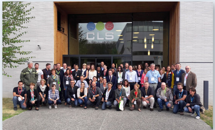
Attendees of the French Argos User Meeting outside CLS Headquarters.